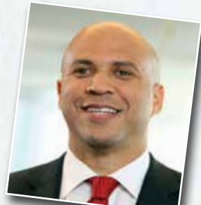
U.S. Senator Cory Booker